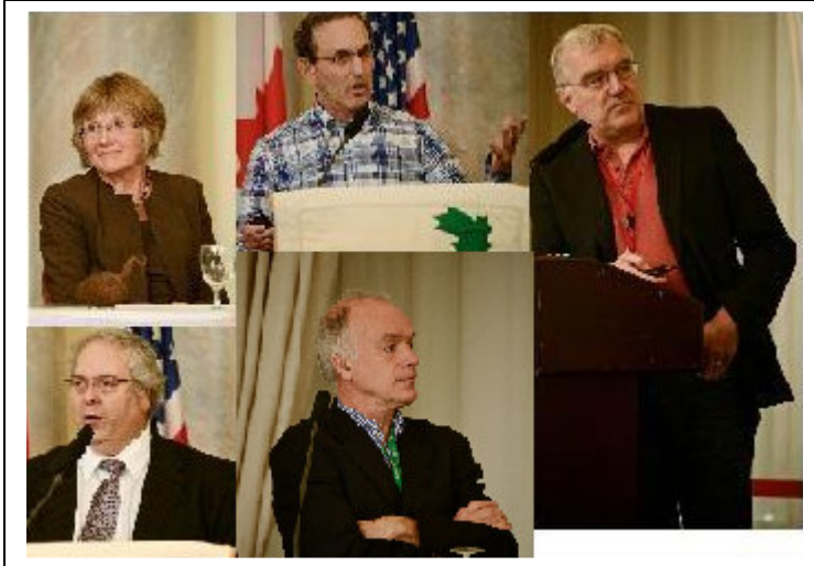
Participants in the Joint Symposium – Sept. 18 – Ottawa “Discovery Research is the Foundation of Innovation in the Health Sciences”