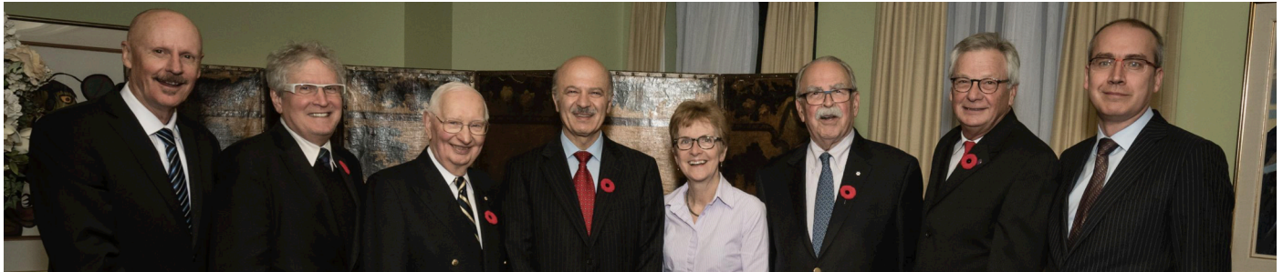
2016 Friesen Prize – Award Presentation at Rideau Club – November 7, 2016 - Ottawa