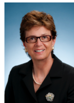
FCIHR Lecturer at 2016 CSCI-CITAC Annual Meeting on Nov. 22, 2016 - Toronto