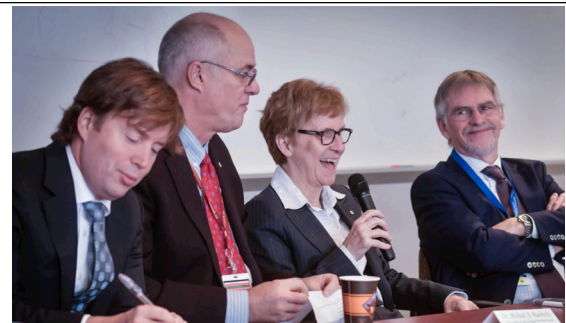
OHRI Symposium - “Regenerative Medicine as a Gateway to Translation & Innovation: Advances & Moving Forward”