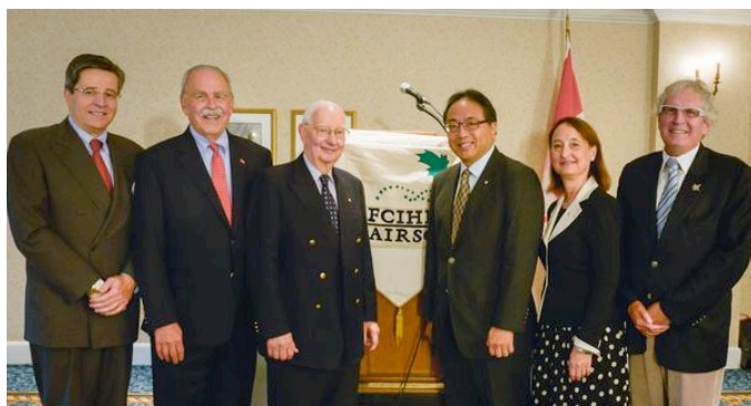
Leaders’ Breakfast Welcoming Dr. Lap-Chee Tsui Sept. 17 – Ottawa