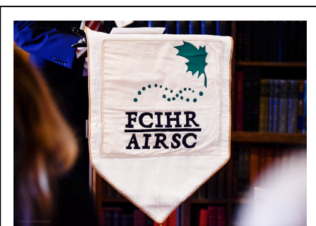
FCIHR Podium Scarf – circa 2000