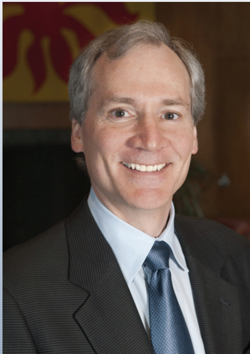
Marc Tessier-Lavigne, PhD President of The Rockefeller University Winner of the 2012 Henry G. Friesen International Award

Registration is required. Please click here: UofT Oliver Smithies Lecture